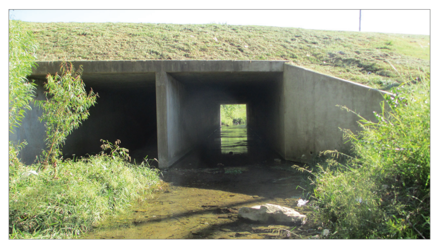
Clockwise from upper left: Creekside Park; Ballfields and pathway; Culvert under US 62 (undercrossing potential)