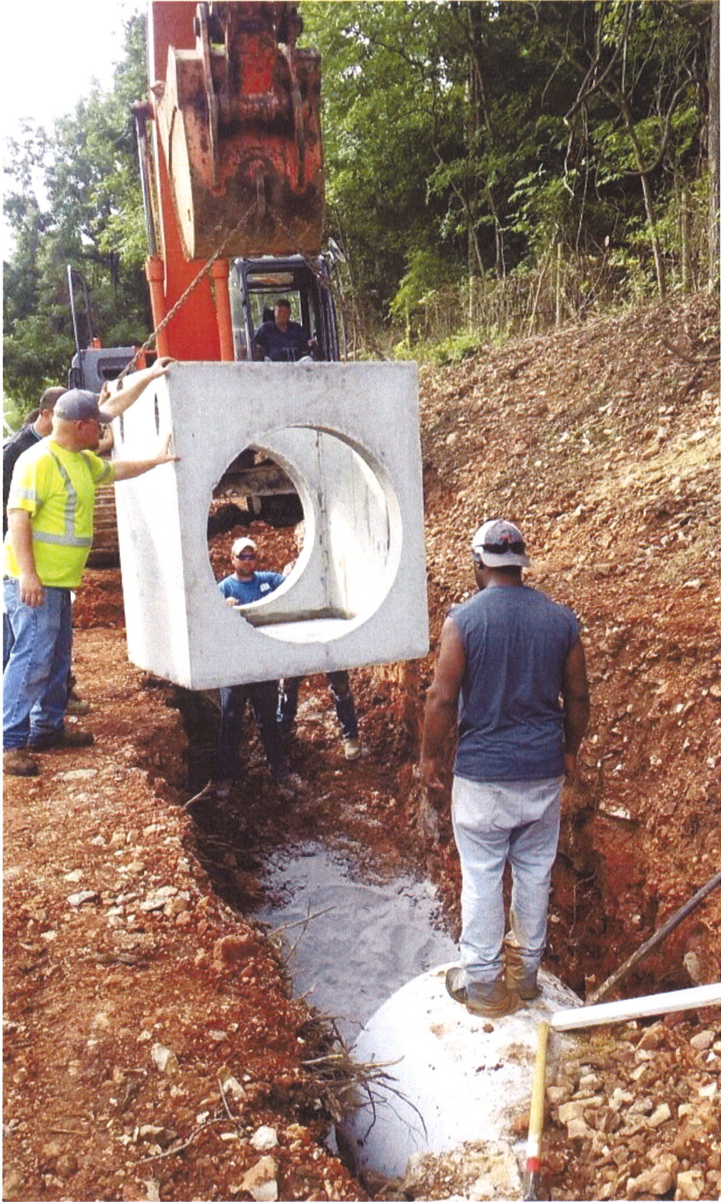
Junction Box, oriented S.