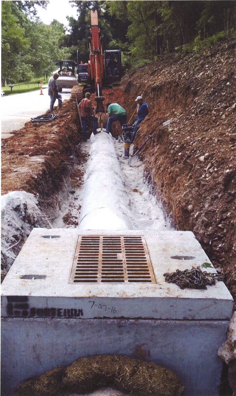
Laying 30" RCP out of junction box, oriented S.