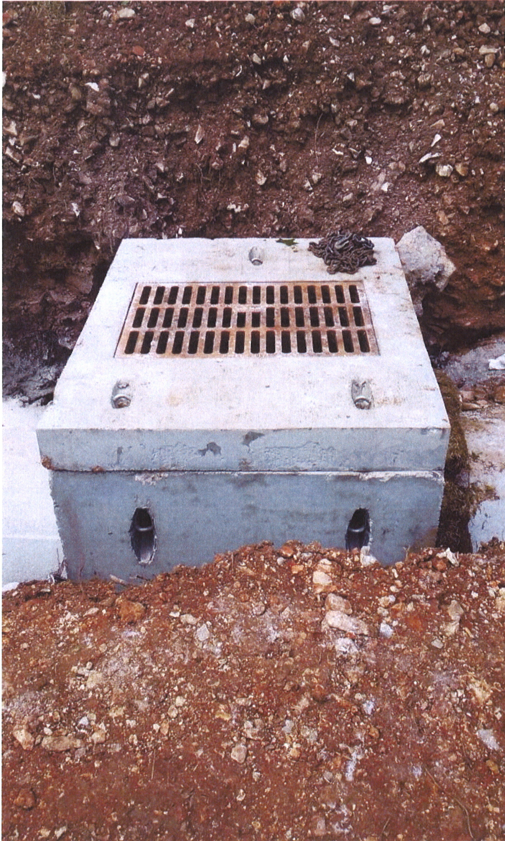
Junction Box installed, oriented W.