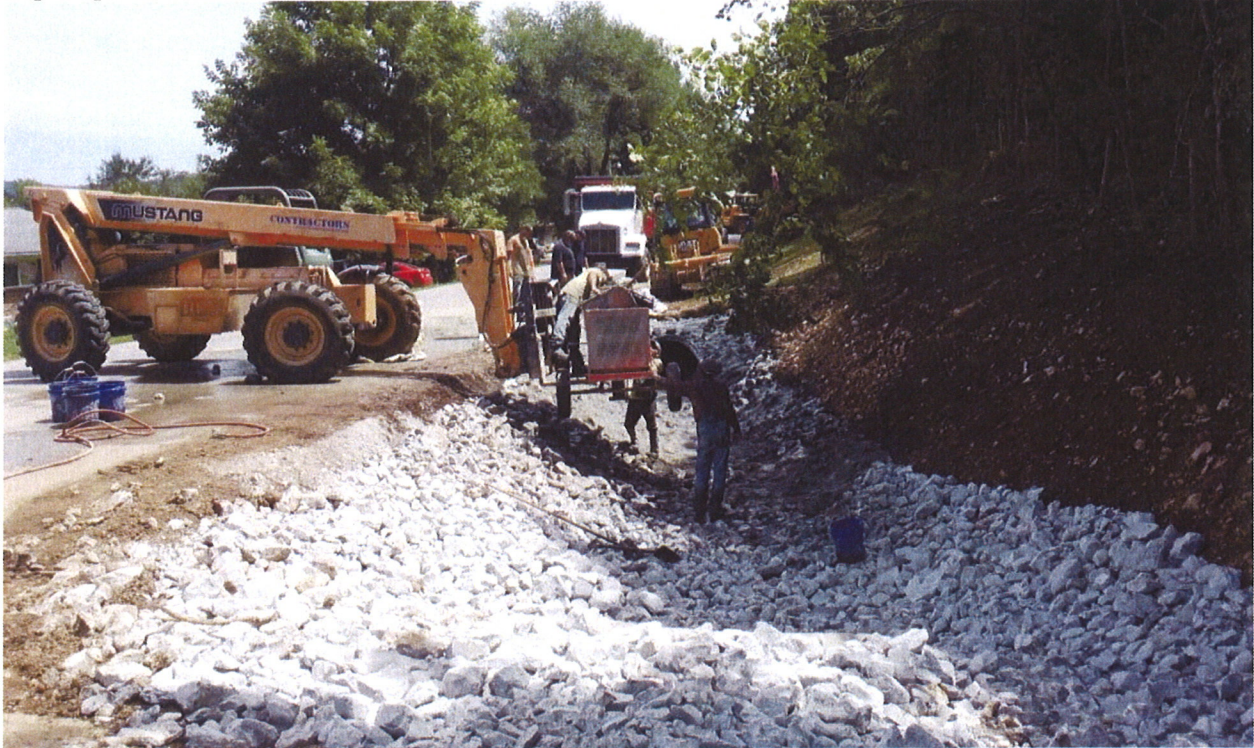
Rip Rap between 36" FES and 42" FES, oriented S.