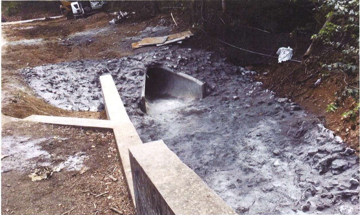
Rip Rap between 42" FES and culvert, oriented S.